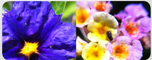
With Macro Lens