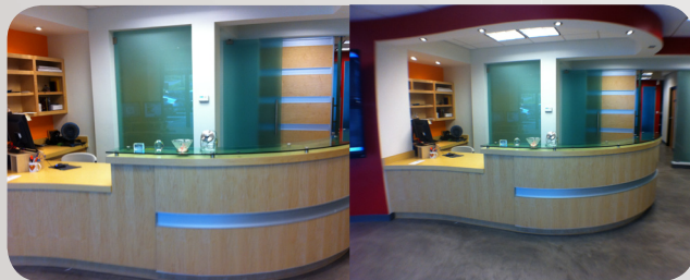
Before Wide Lens